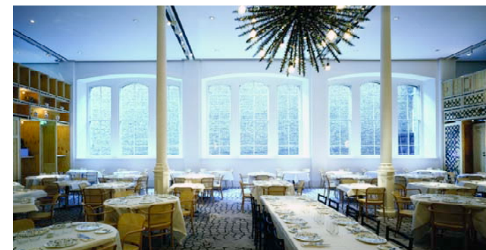
Kohn excludes two windows from view, offering a more emphatically symmetrical composition.